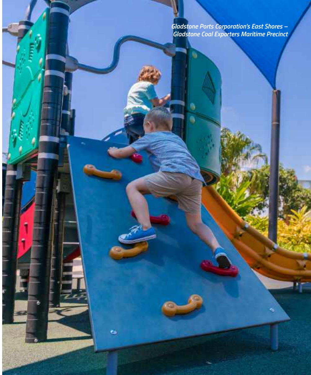
Gladstone Ports Corporation's East Shores – Gladstone Coal Exporters Maritime Precinct