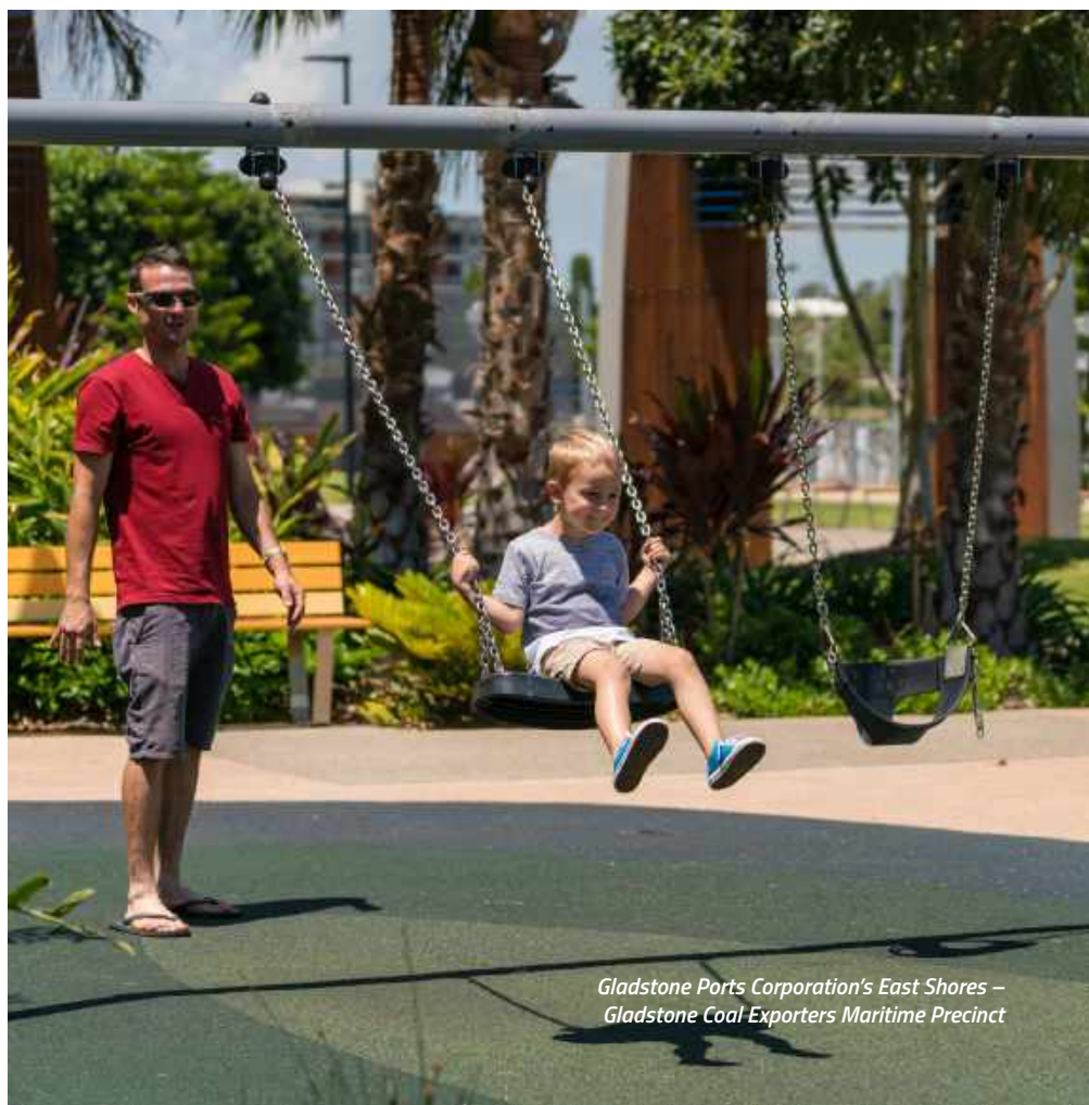
Gladstone Ports Corporation's East Shores – Gladstone Coal Exporters Maritime Precinct